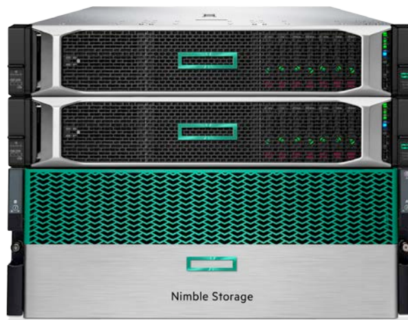
HPE Nimble Storage dHCI

With HPE Nimble Storage dHCI, enterprises can run faster with rack-to-apps in less than 15 minutes, end the fire-fighting with predictive analytics delivering 99.9999% data availability by HPE Nimble Storage, and optimize everything with higher productivity and maximum resource efficiency.