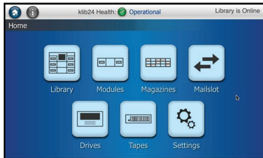
Figure 1. StorageTek SL150 modular tape library touchscreen operator panel

With the StorageTek SL150, simplicity begins with the library installation and continues throughout the life of the product, even as you expand for data growth. The library can be initialized in a few steps via the local touchscreen operator panel, and upgrades are easy because they require no tools, complicated cabling, or technical support.