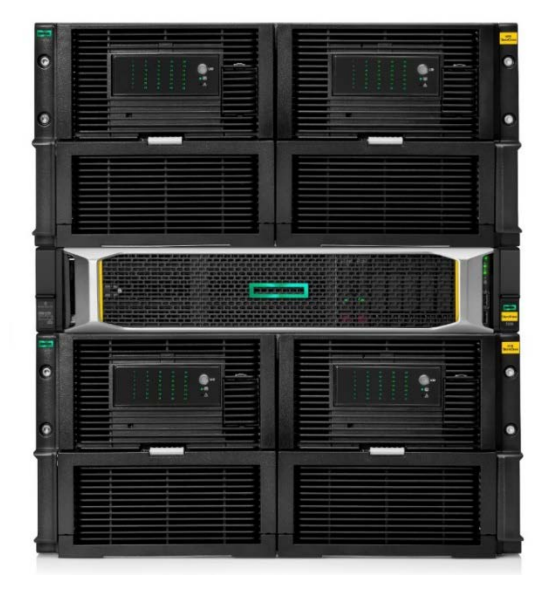
HPE StoreOnce 5250 Systems

HPE StoreOnce 5200 delivers scalable backup and restore for small to midsized data centers, and provides an ideal replication target device for up to 64 remote and branch offices. This scalable 4U appliance offers from 36 to 216 TB* of usable local capacity using upgrade kits and up to 648 TB with Cloud Bank Storage, and provides a solution to shrinking backup windows with speeds of up to 33 TB/hour using HPE StoreOnce Catalyst.